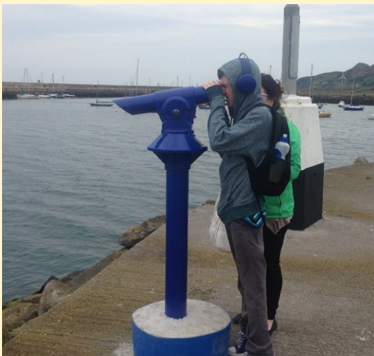
Sight seeing in Howth