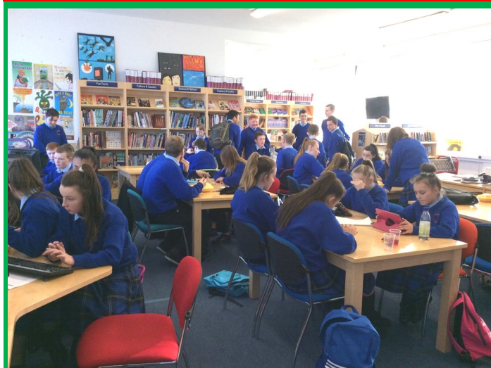
At lunchtime the library is full of students who come up to read, borrow a book or magazine, have a chat with their friends, use the computers or play chess or XBOX, or just to relax. We are very lucky in Coláiste Eoin to have our JCSP library.

To celebrate science month in November we had a forensics science workshop called "A Case of Conspiracy". Students learnt all about the science behind police work. They gathered a variety of clues, then analysed their findings to solve the crime. It was like having CSI in the main hall and it really brought science to life for the students taking part.