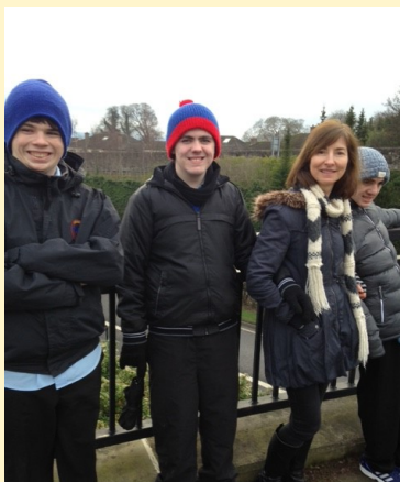
Getting out for a walk