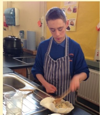
Cooking up a treat