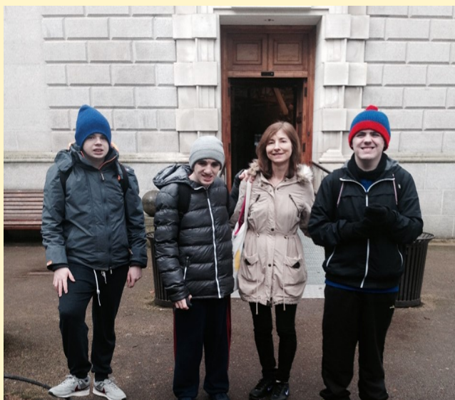
A visit to the Natural History Museum