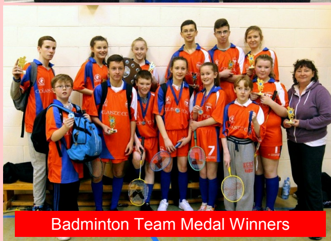
Badminton Team Medal Winners