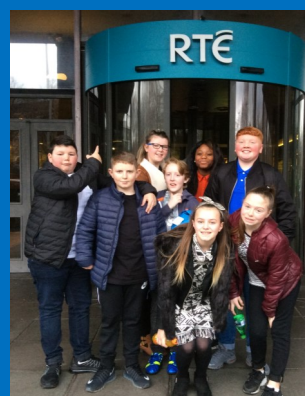
Coláiste Eoin Rappers at the RTÉ studios.

This year the school have also been involved in some exciting new initiatives such as SICAP and our European exchange students and the ongoing development of our iPad project. Check out our website to see videos and more information of our various events www.colaiستeeoin.ie