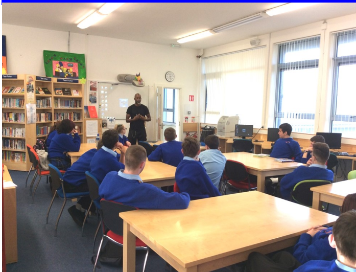
Raven, our writer-in-residence, working with students to write poems about 1916.