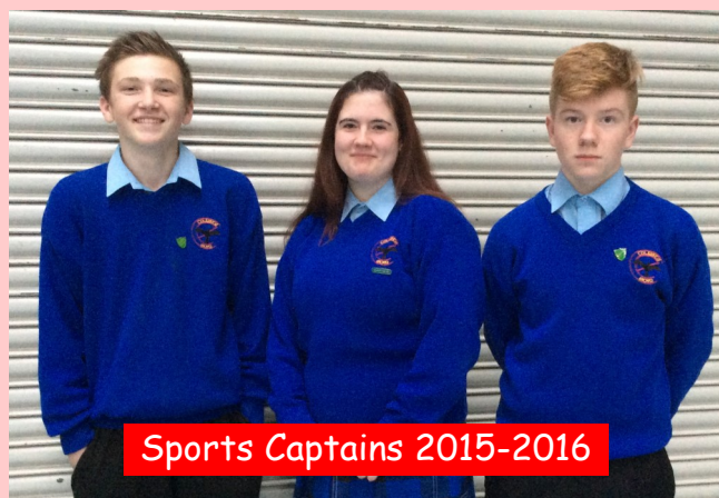
Sports Captains 2015-2016